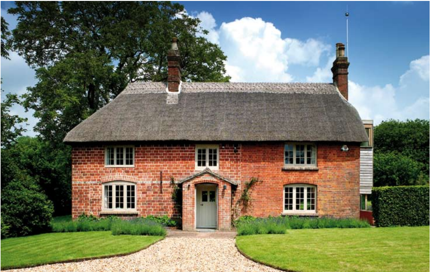
Award Mirldown House, Wiltshire